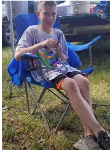
Bert May Boy Scout Camp