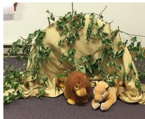
Scenes from VBS 2019