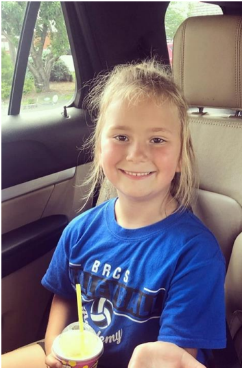
Elliana Coffey School Volleyball Camp