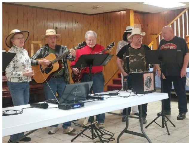
Spring Hillbillies Singing