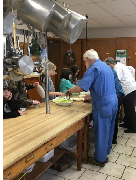
Serving the Green Snack

We have lots of activities coming up during Holy Week beginning with Palm Sunday on April 14 th through Easter Sunday on April 21 st . The Spring Hill Easter Egg hunt will be held on April 20 th from 9:00 to 12:00. The morning promises to be lots of fun for the children with coloring and hunting for eggs, crafts, music, and a light lunch. You are always welcome to let your children bring friends. Please let me know how many you will be bringing so that we will be sure to have plenty eggs for everybody to color. The sign-up sheets will be available soon.