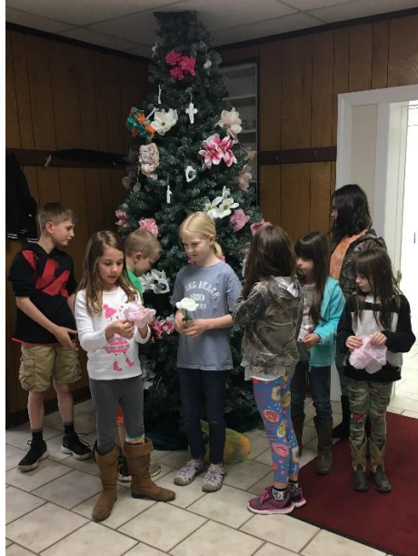
Decorating the Easter Tree